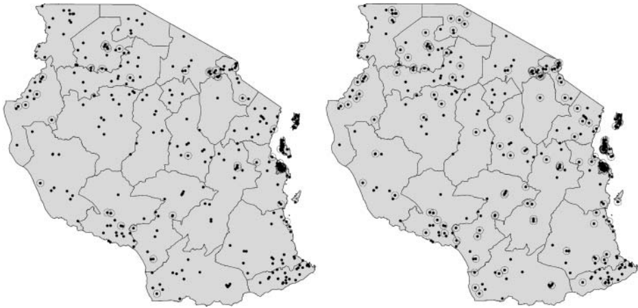
Figure 1 Rollout of Mobile Money Agents across LSMS-ISA Enumeration Areas (Agents Operating in Village)

Notes: The maps depict the 26 regions of Tanzania with points representing the enumeration areas from the LSMS-ISA survey. Circles represent enumeration areas with a mobile money agent in operation in the village. The left panel is for the 2010 survey year; the right panel is for the 2012 survey year.